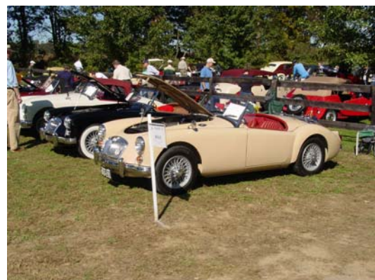
Some Beautiful MGAs, as Well!