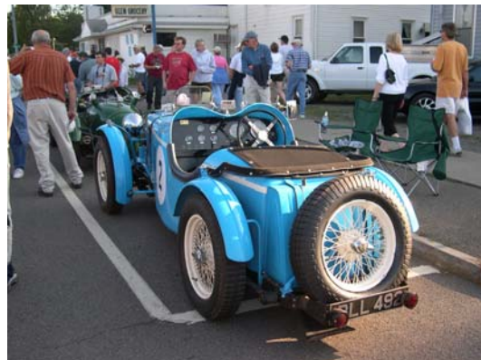
A Beautiful Clipper Blue Classic Racer