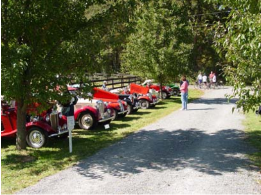
MG-Ts Lined Up along the Main Entrance