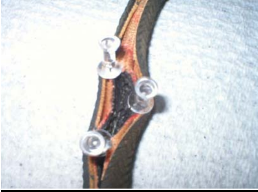
Split (Very) Bad Brake Hose