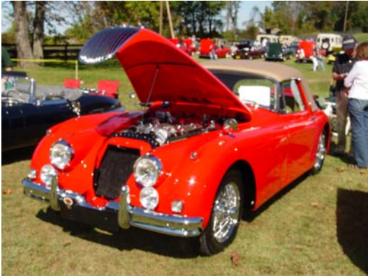
An Incredible bright RED Jaguar