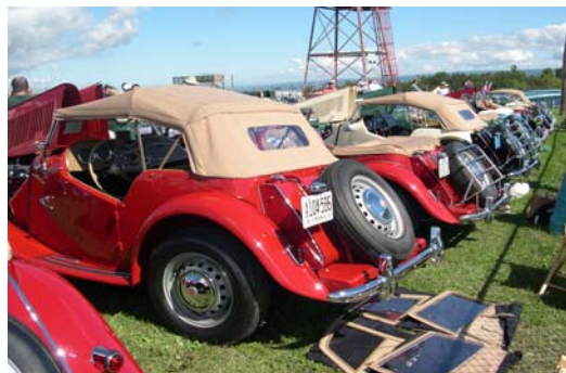
MGTDs from Astern