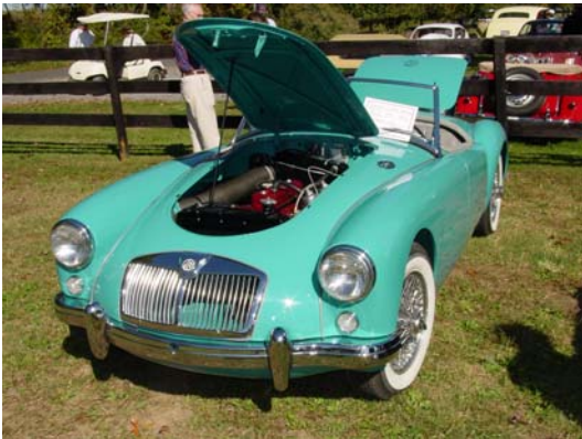
A Robin's Egg Blue "Perfect" MGA

I hope you enjoyed these articles, and the pictures!