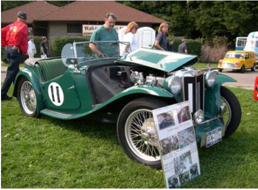
Where Can I Get One for Me Like This?