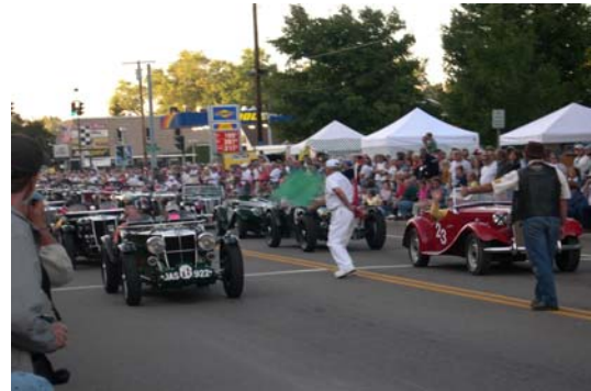
On Your Mark .. Get Set ...