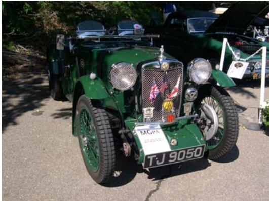
A Beautiful MGPA on Display

Watkins Glen. This was followed by two laps around the old race course through the streets of Watkins Glen. Many classic cars were on display in the park across from the Town Hall. Literally hundreds and hundreds of people lined the streets of the Glen all day long to watch cars and see what the vendors were offering.