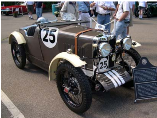
A Pre-War MG Racer