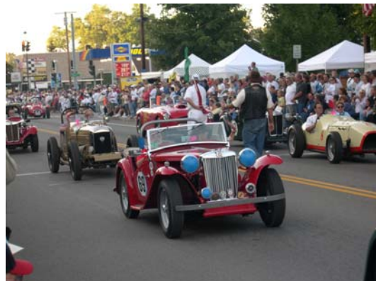
More Vintage Racers on Parade