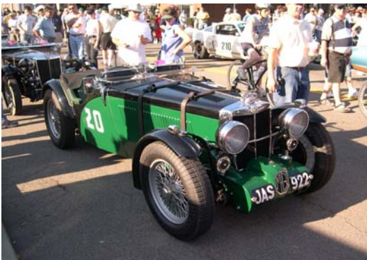
Another Sleek Vintage Racer