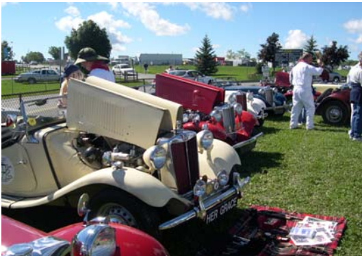
MG-Ts Out in Force