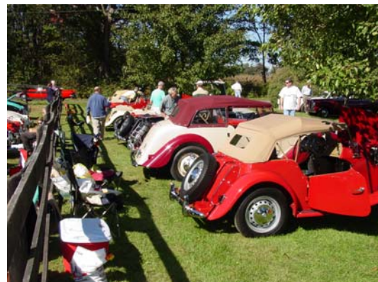
A Good Turnout of T-Series