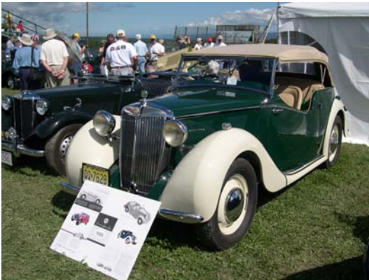
Just Too Sharp for Words!