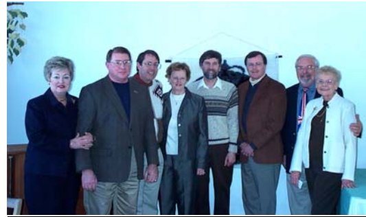
The Usual Familiar, Smiling Faces