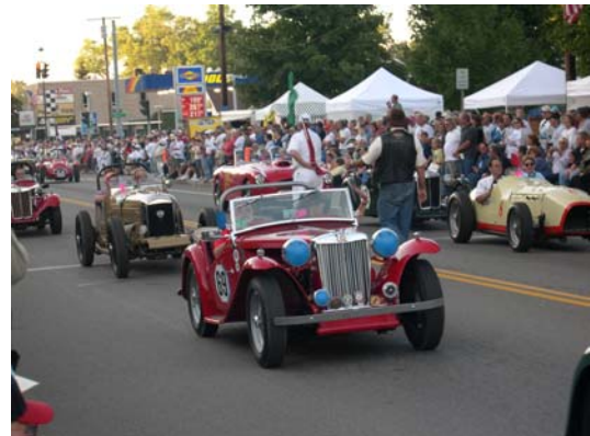
And ... Off They Go!

That's all for this edition, MG-T lovers! I hope you enjoyed the articles and pictures! Comments, articles, tech info, pictures, ads, and other inputs are always welcome!