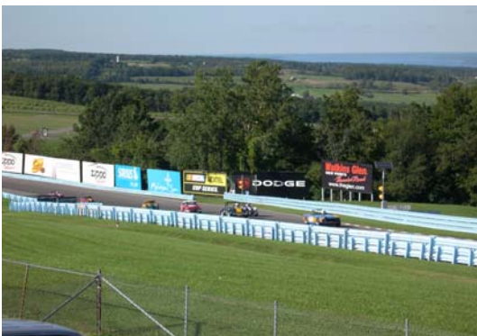
More Racers Zooming By!

Vintage racing went on for 2 days at Watkins Glen International. Saturday the "T" car show was held in the paddock on the International Raceway. 11 TC's, 35 TD's and 9 TF's made up the classes. 5 very nice variants were displayed and there were 12 Premier cars on display.