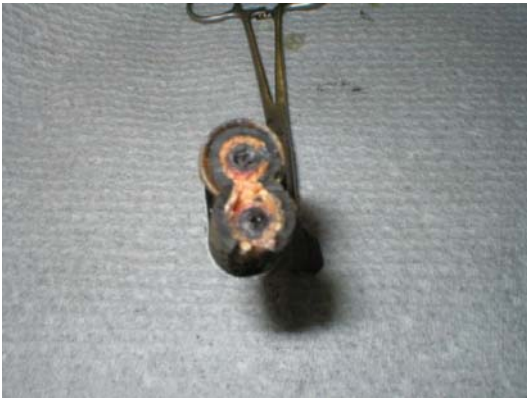
Another Shot of My Bad Brake Hose!