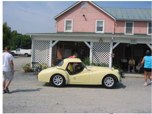
43 – Triumph TR3A, 1959, 1 st Place Bruce Hogeland