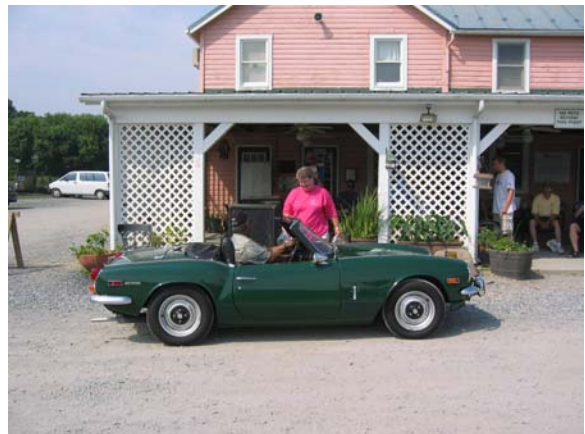
45 – Triumph Spitfire, 1970, 1 st Place B. Carpenter