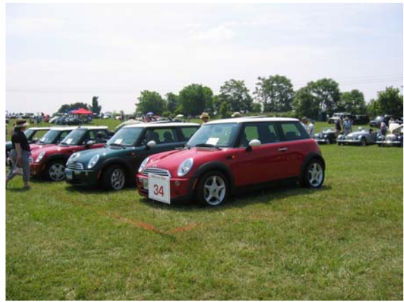
Does anyone recognize this Mini?