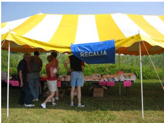
Congregating under the Regalia tent