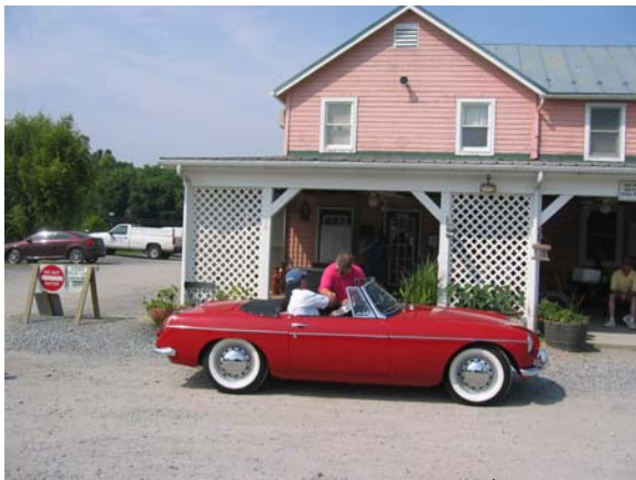
29 – MG B/C thru 1974, 1962, 1 st Place Brooks Amiot