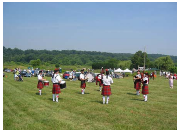
The Frederick Scottish Pipes and Drums