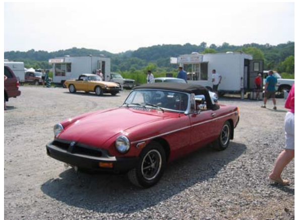
30 – MG B from 1974