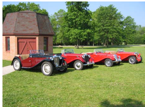
The top winners – note they are all red!