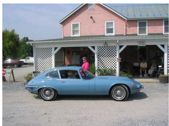
10 – Jaguar XKE III, 1972, 1 st Place Russell Shope