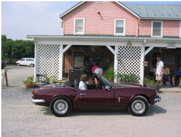
45 – Triumph Spitfire, 1969, 3 rd Place Terry Kahl