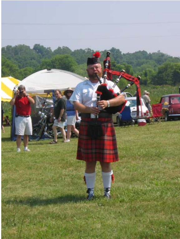
What a talent – very entertaining!