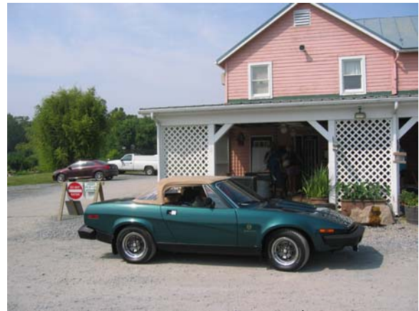
48 – Triumph TR8, 1980, 1 st Place Elise Bryant-Snavely