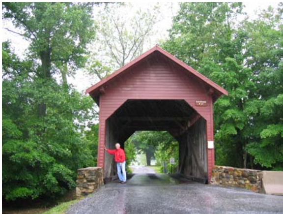
Just trying to keep dry on Covered Bridge Tour