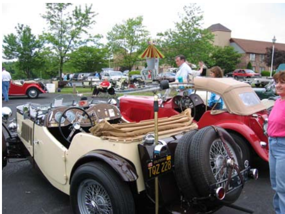
The Little’s “Cream Cracker” with moving carousel attached