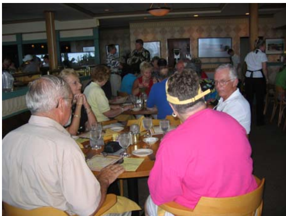
The "Summer Lunch Bunch"