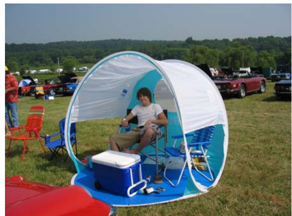
Now this is life!!