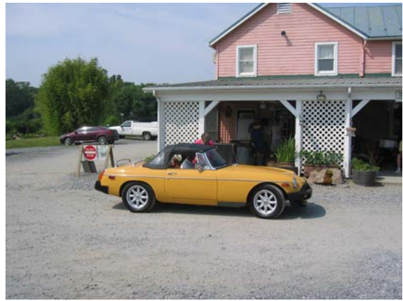
30 – MG B from 1974