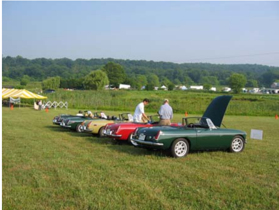
The "Bs" beginning to line up

And here are some additional pictures of Original British Car Day!