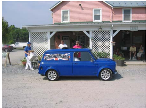
Blue Mini Van