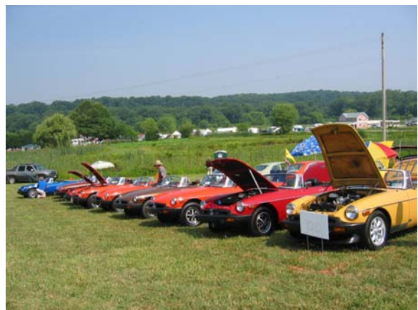
How many red "B's"?