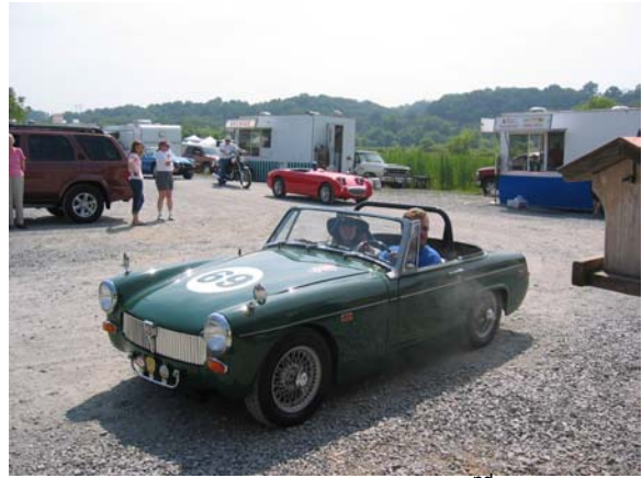
32 –MG Midget MK III, 1969, 2 nd Place Jim Sheats