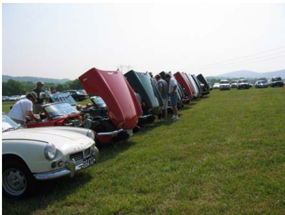
"Hoods" in a row