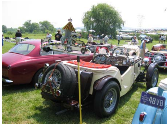
The Little's car with moving carousel