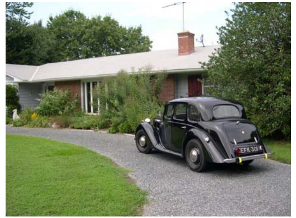
The Chiste's (new members) 1950 MGYA.