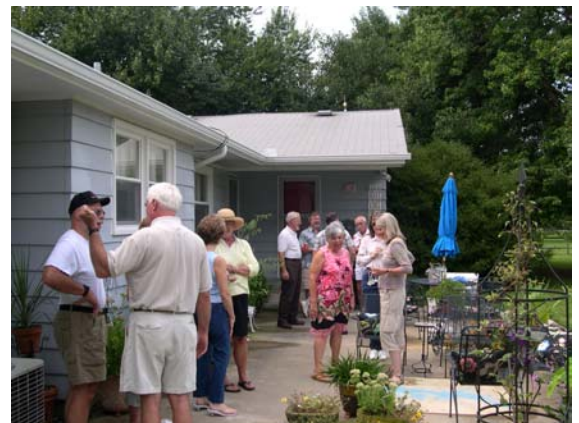
Gathering of the faithful!