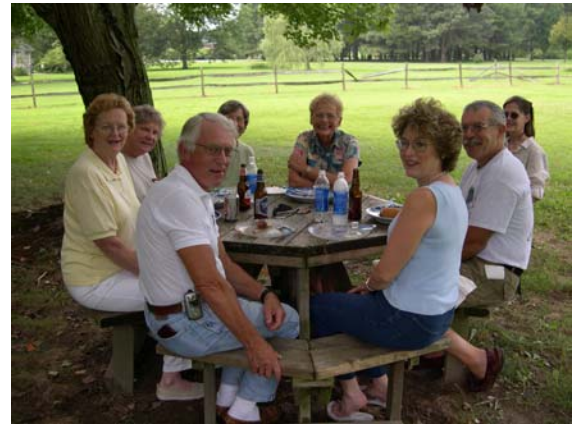
Part of the gang!