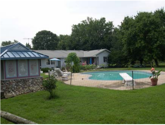
No one went swimming? And it was a hot day!