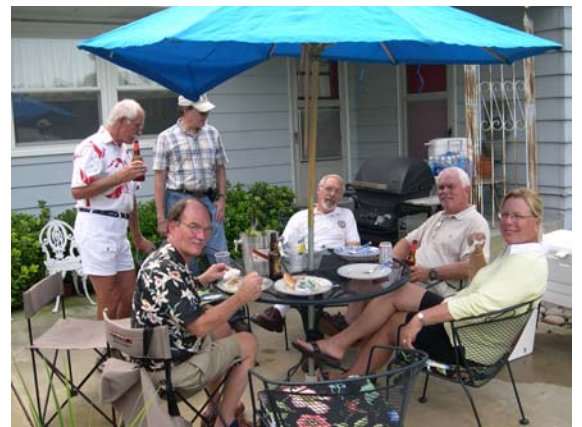
Another part of the gang!