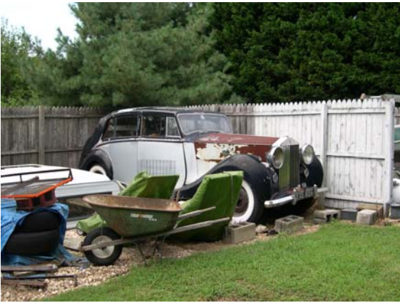
Under restoration-maybe a little TLC will put it on the road!