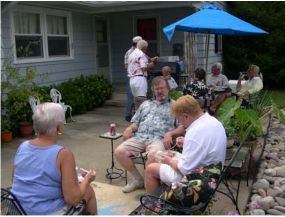
Even the Ashes came from Virginia Beach!