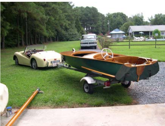
Do you really pull that boat with that car?