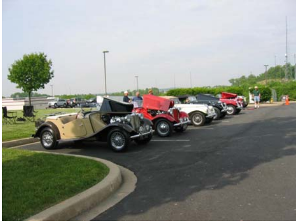
Ready for voting