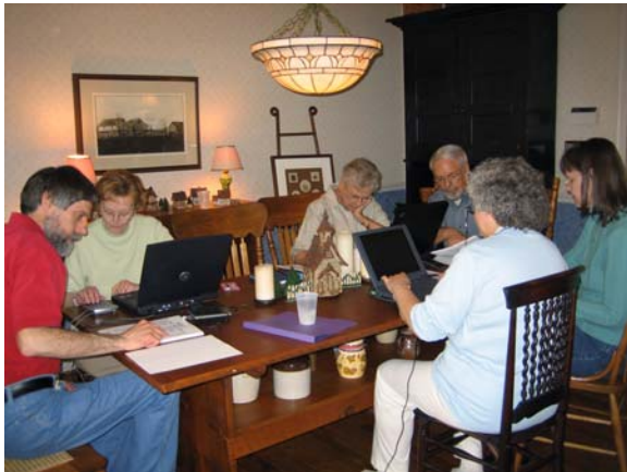
Learning the new balloting system