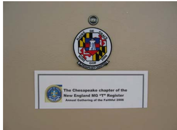
Havre de Grace patch