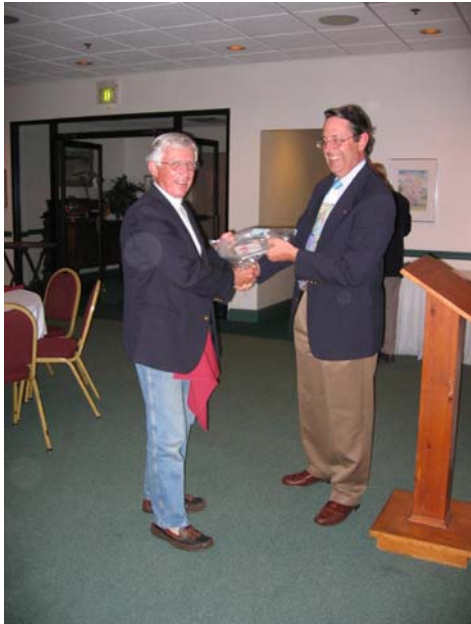
My! My! Did we forget the red napkin was there?