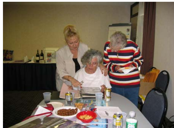
Studying one of the picture albums