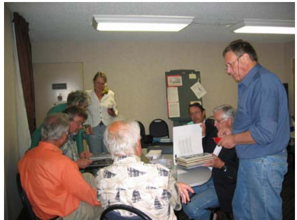
The Men's Group