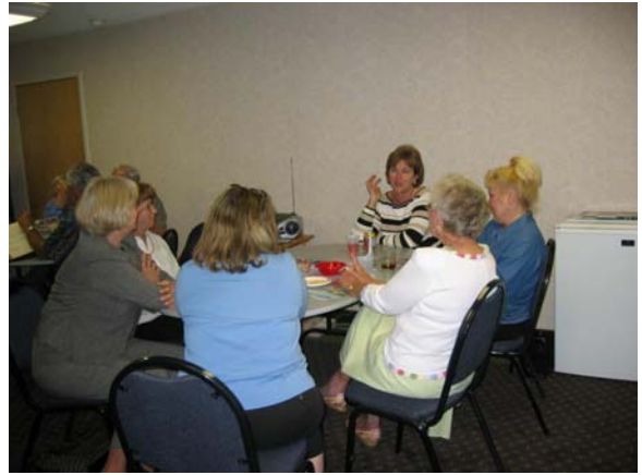
The Ladies Circle