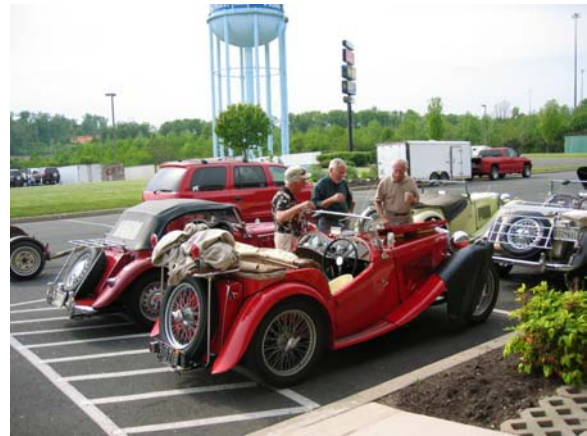
Discussing the cars.

The following photos reflect our good time.