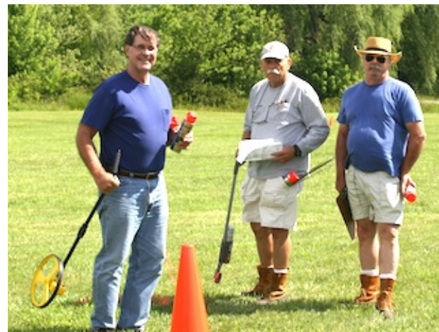
Above: Set-Up Crew - June 2