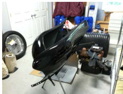
Fenders All Painted Black!