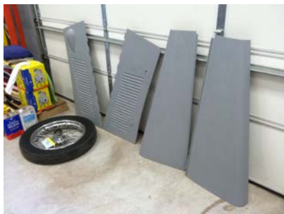
Bonnet Bits Ready for Color