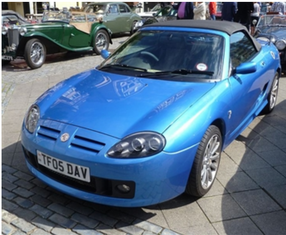
MG's modern TF beside an M-type Midget, which Kimber built in 1929 and turned into the top-selling sports car.

The Midget wasn't just a car. In the 1930s, it became a way of life in England. Adventuresome motorists drove the Midget to work, then used it for weekend races and what the British called trialing.