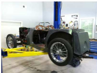
MGTC back on the Lift

This Fall my goals for the MGTC include completing all the painting, getting the parts that require re-chroming all re-chromed, and getting all the new elements I will need to put the car back together. These include a new canvas hood (top), a new leather interior kit, a new carpet set, and new rubber bits and pieces. I hope to have some really exciting pictures of progress to share with you in the Winter Edition of The Square Rigger. Stay tuned! Encouragement appreciated!