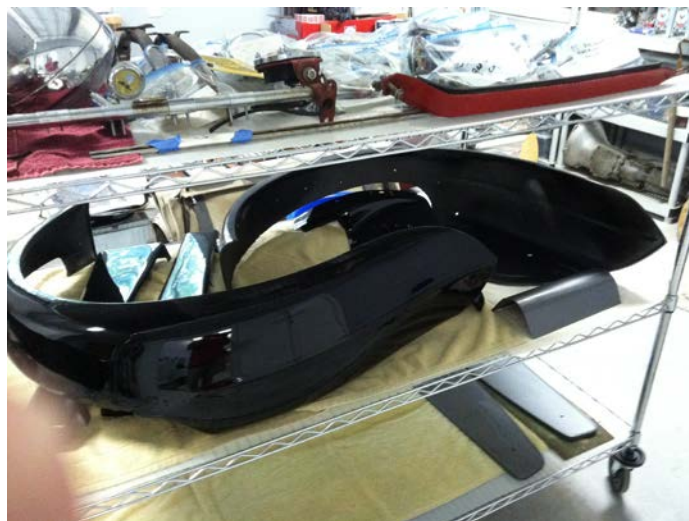
Shiny, Painted MGTC Rear Fenders Stowed on my Removed Parts Storage Shelves