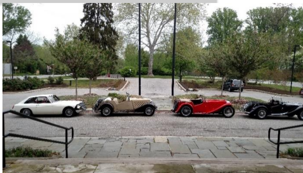
On tour at the WW II Memorial