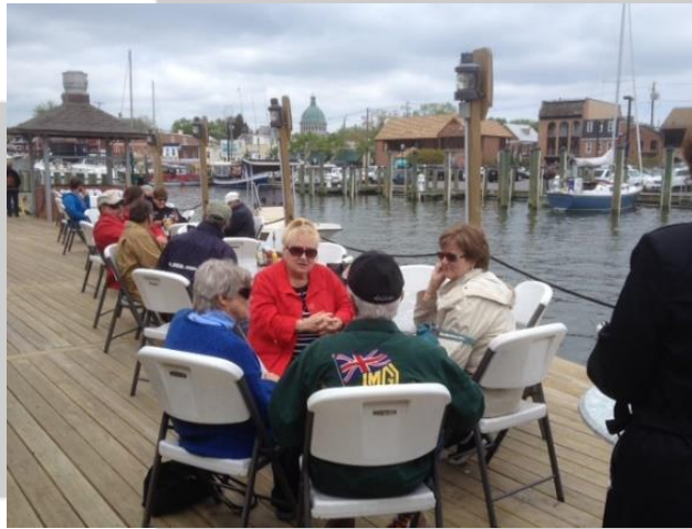
Relaxing downtown Annapolis