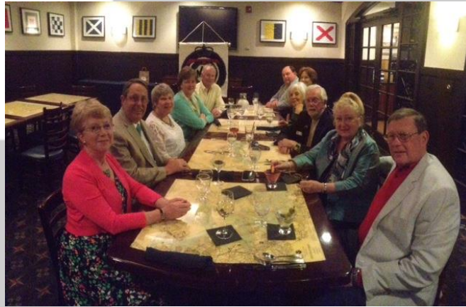
After a fun filled day our farewell banquet