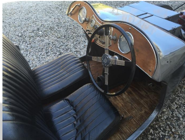
MGTC with sleek "Racing Interior"

Now comes the final stretch --- getting the interior reinstalled, the re-chroming of the grill surround and the windshield frame accomplished, and the body parts of the car reassembled. I have ordered and now have in hand almost all of what we'll need --- the new hood, the side curtain recovering kit, the carpet kit, two Brooklands screens (I have always wanted these on this car!), many of the new rubber parts, and various new nuts and bolts (ordered from "From the Frame Up") for final reassembly. The new black leather interior panel set is on backorder, but we hope to have that delivered soon. No later than the FALL issue of The Square Rigger, we hope to have photos of the completed car to share!