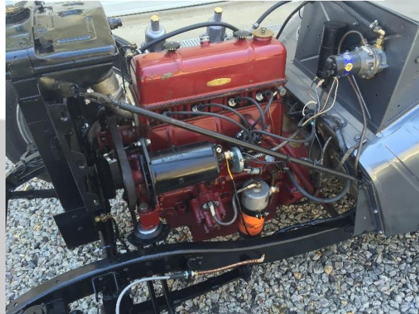
MGTC Engine, Port Side