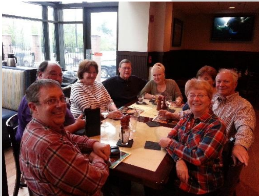
Enjoying cocktails Friday afternoon