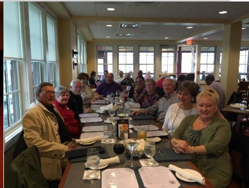
Dinner at the Eastport Yacht Club