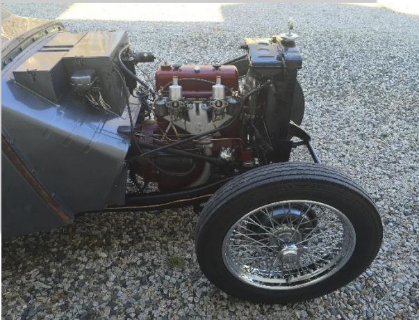
MGTC Engine, Starboard Side