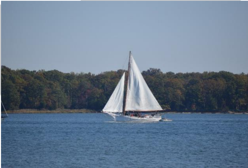
Our Club Symbol --- A Real Chesapeake Bay Skipjack

New members, please send me a photo so that I can include in a future TSR!!