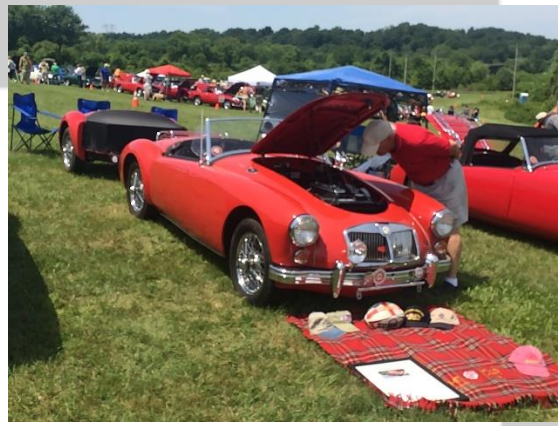
Re-chromed Elements of the Windshield Frame