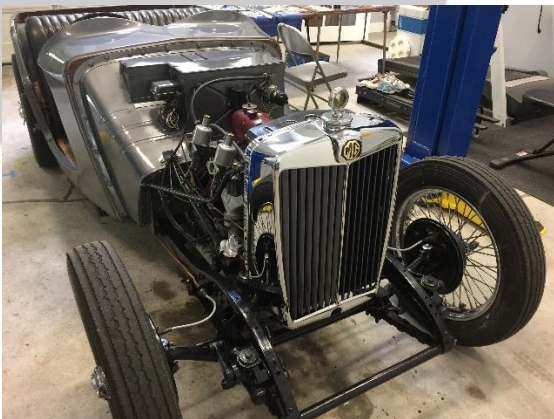
New Grille Shell from the Right

We will begin soon with the installation of the new interior, and then reassembly of the body parts. Then, installation of the new black top and side curtains. Finally, we'll need new tires, tube, and protective strips for spoke ends. I am still planning on changing to Blockley tires, for a different look. We'll begin with the original black seats, but are looking to recover them with dark gray leather, for a nice complement to the body tub color. With no further distractions, the MGTC should be complete and roadworthy in time to participate in Fall car shows and our next MG-T Club Fall Ramble! With persistence & luck, Installment Nr 13 in the FALL TSR edition will be our last! Hard to believe that we began this trek, initially disassembling the MGTC for restoration in the Fall of 2013!