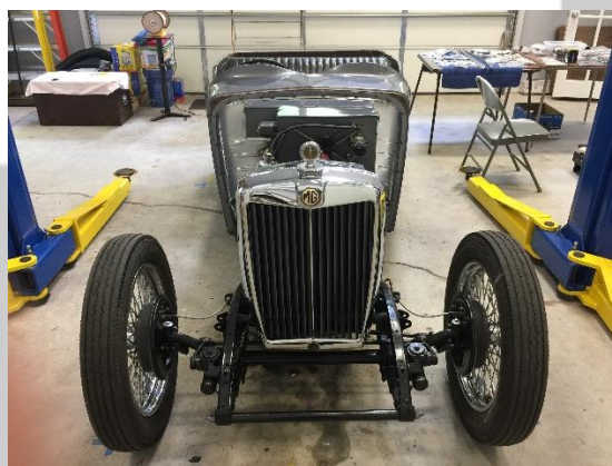
New Grille Shell from the Front

Note: the 1962 MGA 1600 Mk II, the engine compartment restoration and clutch replacement in which were recently completed --- and which work delayed progress on the MGTC by over six months --- has won 1 st Place in Class (MGA) awards at both the "British on the Green 2017" and the "Original British Car Day Nr 40" shows!