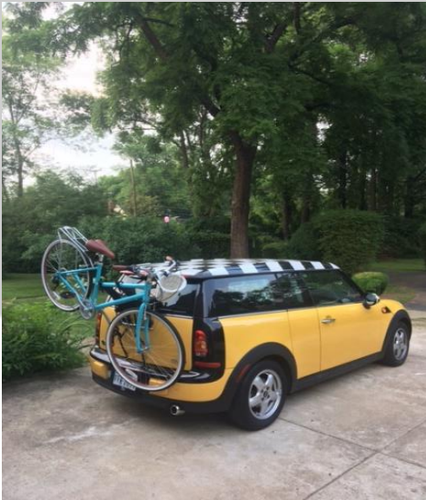
My new ride! The bike is as big as the mini :)