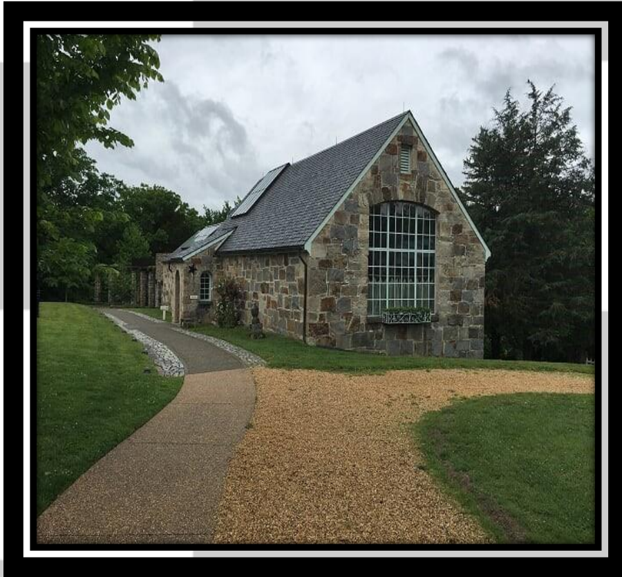
Gari Melcher's Belmont

Saturday morning began with a car show and rally to Gari Melcher's Belmont – American Artist and his 18th Century Estate and Gardens.