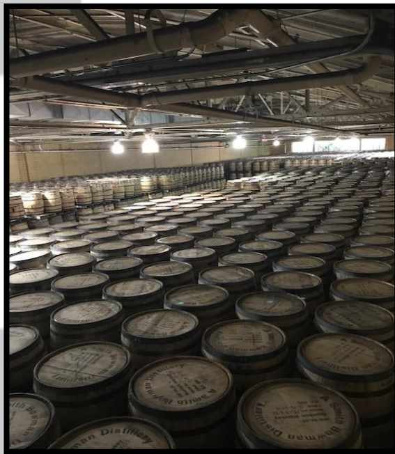
A view from the top of Bowman Distillery

Saturday morning began with a car show and rally to Gari Melcher's Belmont – American Artist and his 18th Century Estate and Gardens.