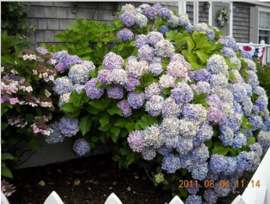
Photo from Nantucket a few years ago ... can't wait to see the hydrangeas again!