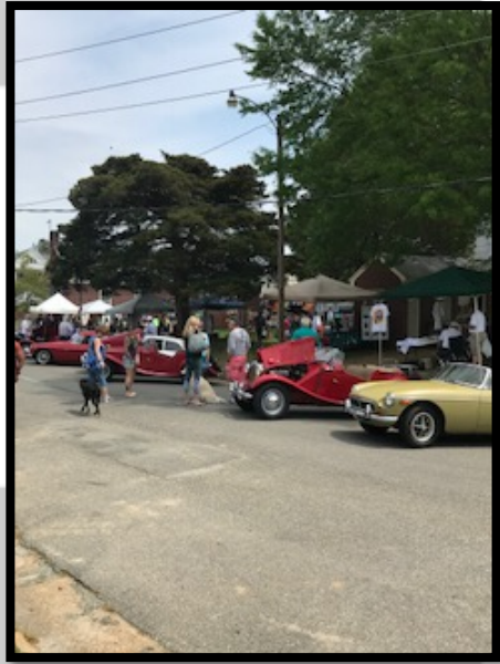
We really enjoyed lunch at Southwinds at Mathews Courthouse on Saturday after the car show. Then we were on the road again headed for another treasure trove ..... Ford Hookemfair Garage!