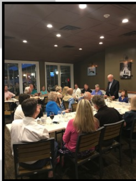
HEAR YE! HEAR YE! The 41 st Meet of the Original British Car Day will proceed!