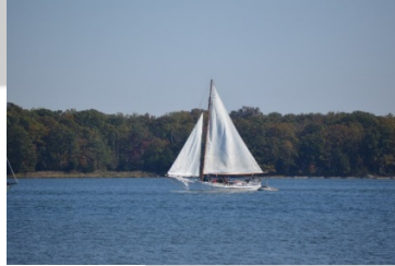
Our Club Symbol --- A Real Chesapeake Bay Skipjack

New members, please send me a photo so that I can include in a future TSR!!