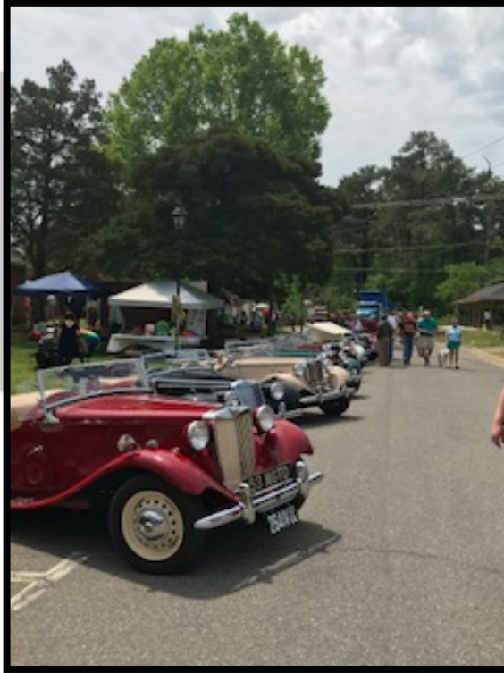
TD's lined up for the car show and street festival in Mathews Courthouse, VA