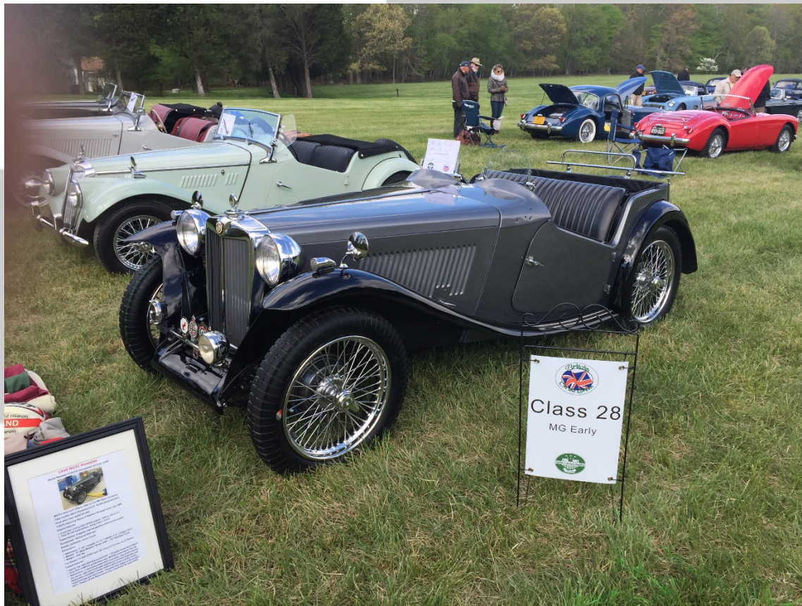
MGTC in the "MG Early" Class at BOG 2018