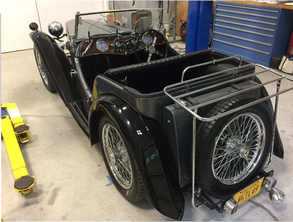
Left Rear Quarter View