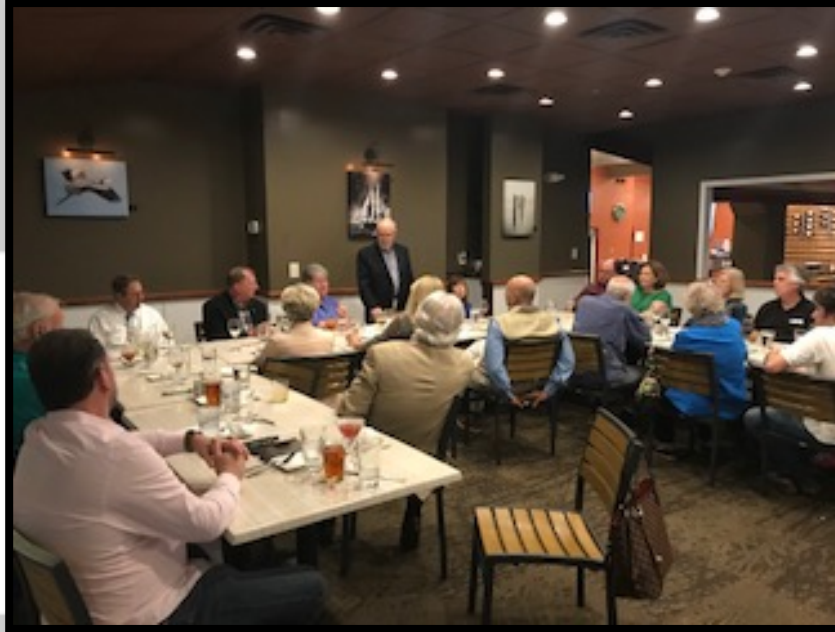
Saturday night dinner at the York River Oyster Factory (at Gloucester Point) was well attended!