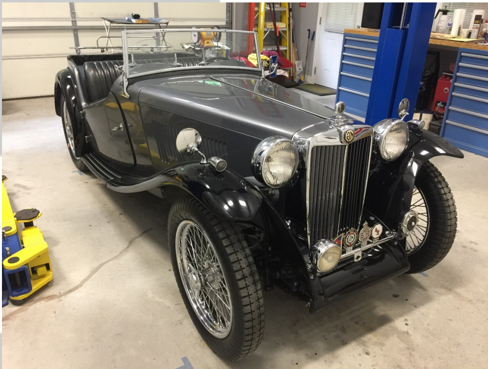
Right Front Quarter View