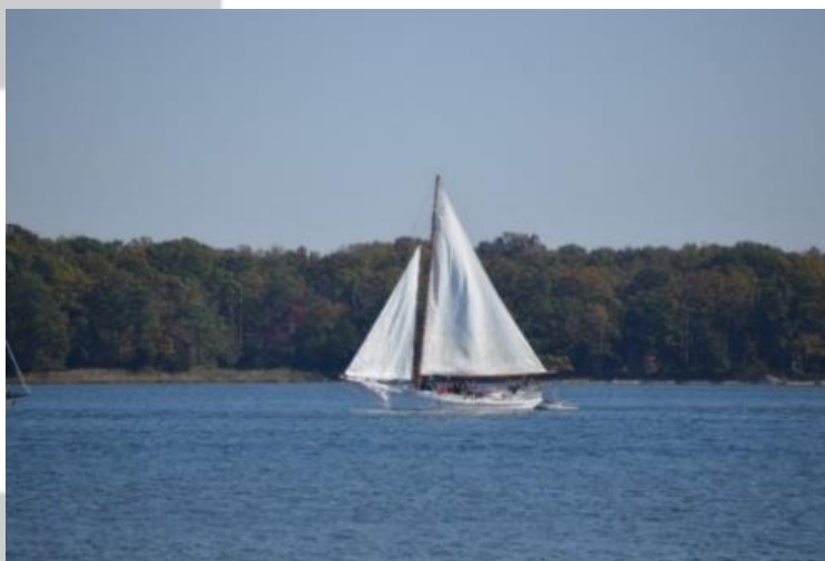
Our Club Symbol --- A Real Chesapeake Bay Skipjack